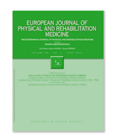
European Journal of Physical and Rehabilitation Medicine

You have access to online journals using your OpenAthens details. You can browse journals using the NHS Knowledge and Library Hub . Here are some of the journals available to you: