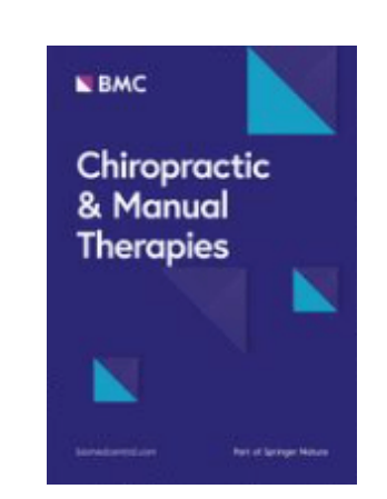
Chiropractic and Manual Therapies