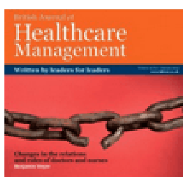
British J. of Healthcare Management