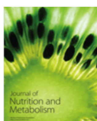
Journal of Nutrition and Metabolism