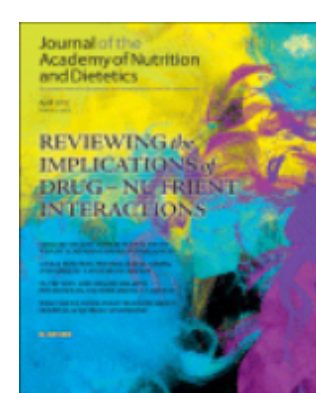
Journal of the Academy of Nutrition and Dietetics