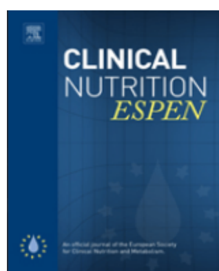
Clinical Nutrition ESPEN