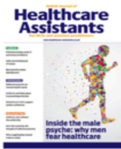
British Journal of Healthcare Assistants

You have access to online journals using your OpenAthens details. You can browse journals using the NHS Knowledge and Library Hub . Here are some of the journals available to you.