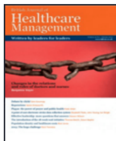
British Journal of Healthcare Management