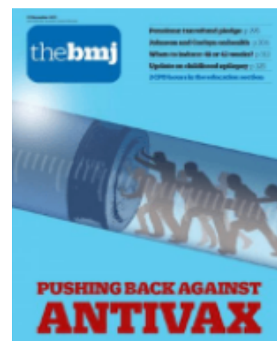
The British Medical Journal